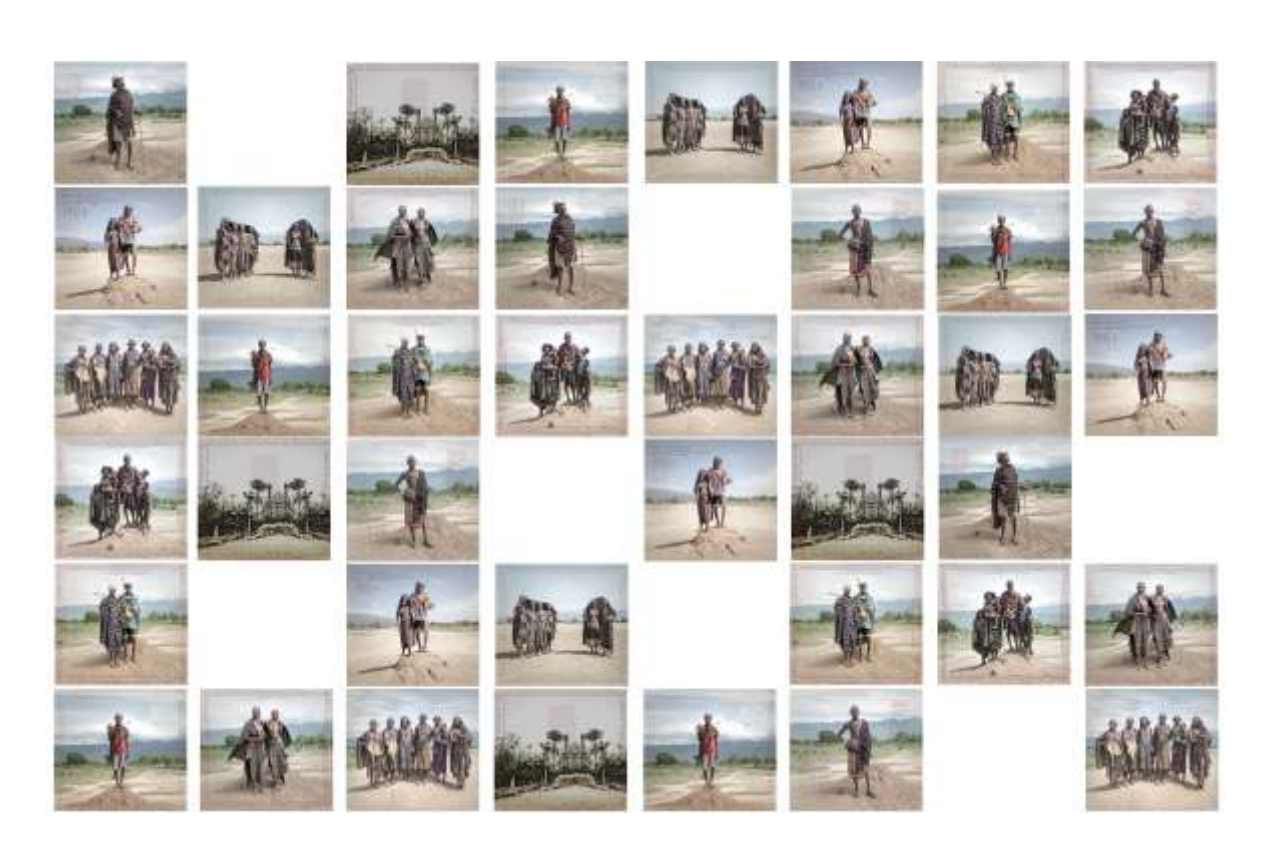
TO BE SEEN INSTEAD OF TO SEE. TRYING TO UNDERSTAND HOW WE ARE SEEN FROM THE OTHER SIDE.